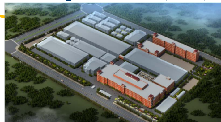
JiangSu- WuXi Site II (2007~)