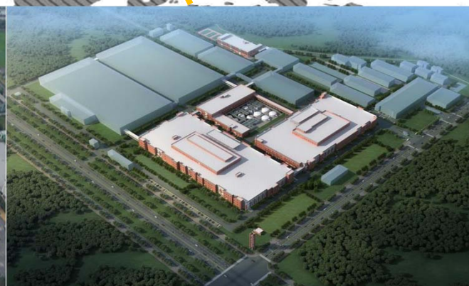
HuBei- XianTao (2013~)