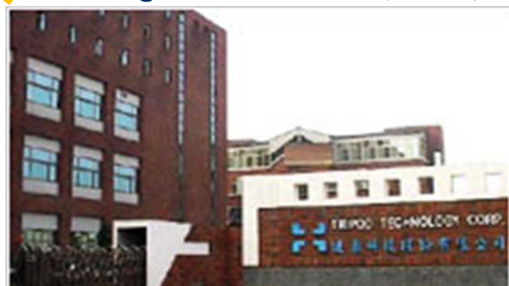
Taiwan- PingJen (1998~)