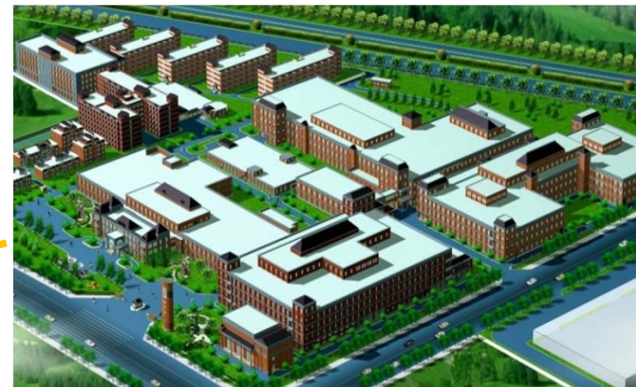
JiangSu- WuXi Site I (2003~)