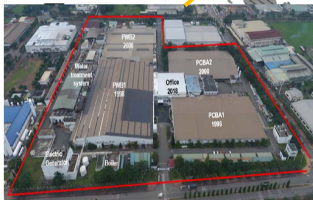
Vietnam- BienHoa (2023~)