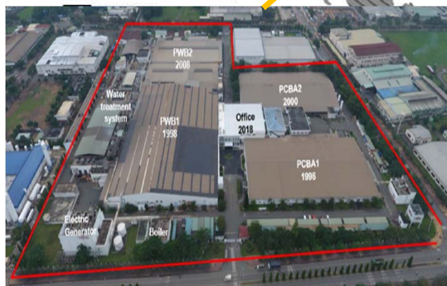
Vietnam- BienHoa (2023~)