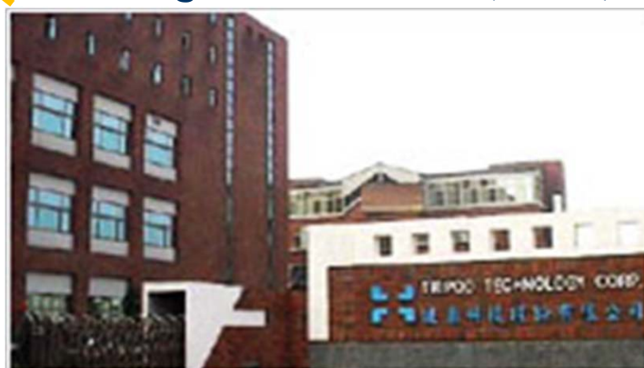
Taiwan- PingJen (1998~)