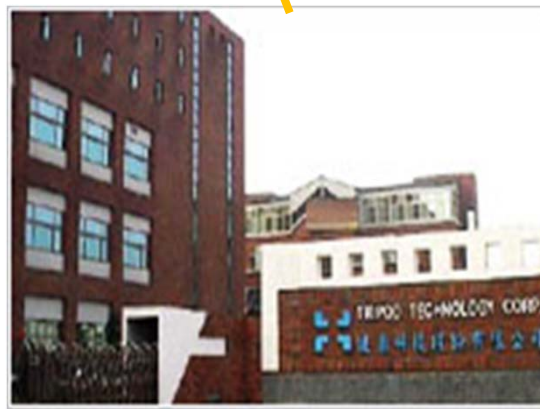
台灣- 平鎮 (1998)