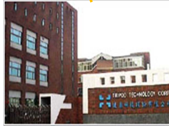
台灣- 平鎮 (1998)