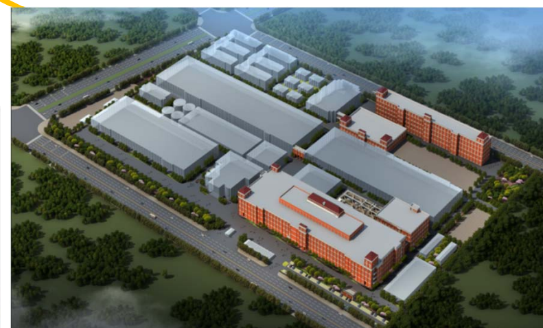
江蘇- 無錫 II (2007~)