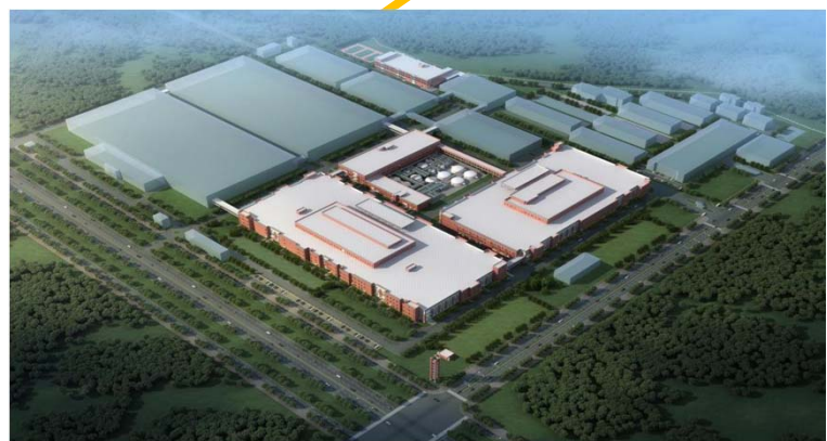
湖北- 仙桃 (2013~)