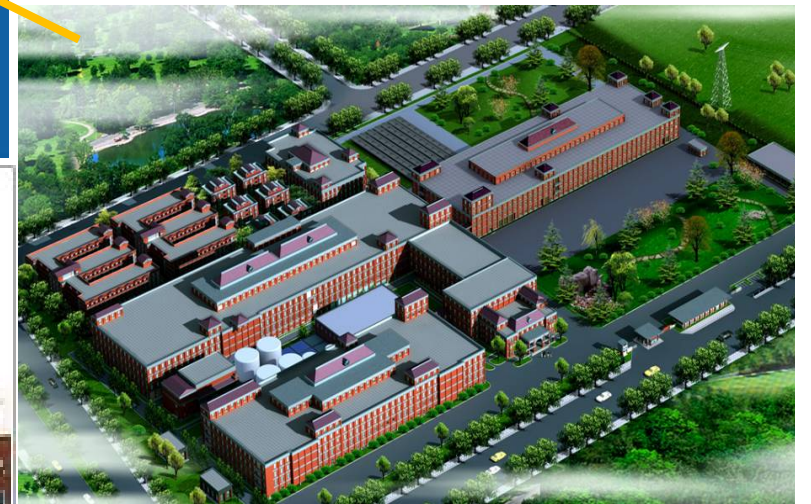
江蘇- 無錫 II (2007)