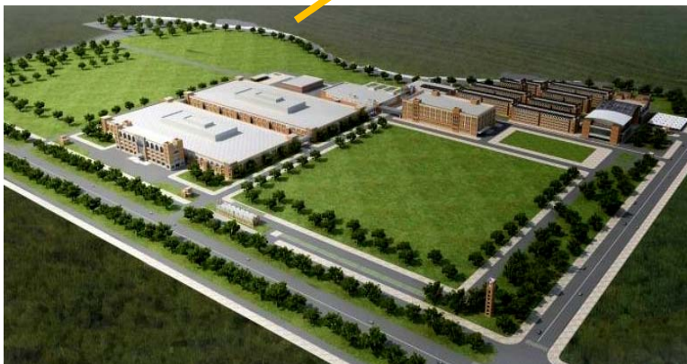
湖北- 仙桃 (2013)