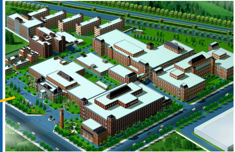
江蘇- 無錫 I (2003)