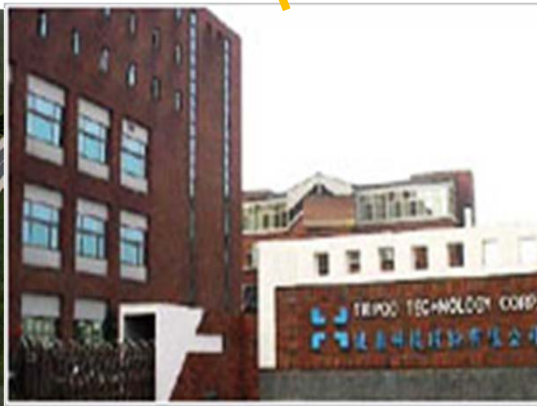
台灣- 平鎮 (1998)