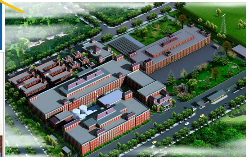
江蘇- 無錫 II (2007)